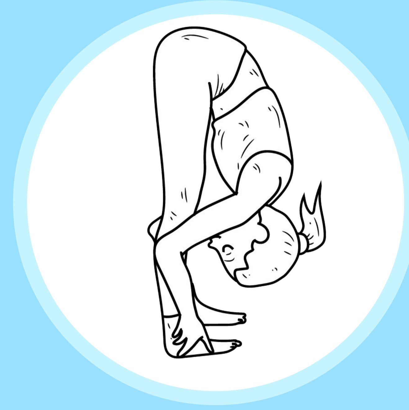
Uttānāsana (forward fold)