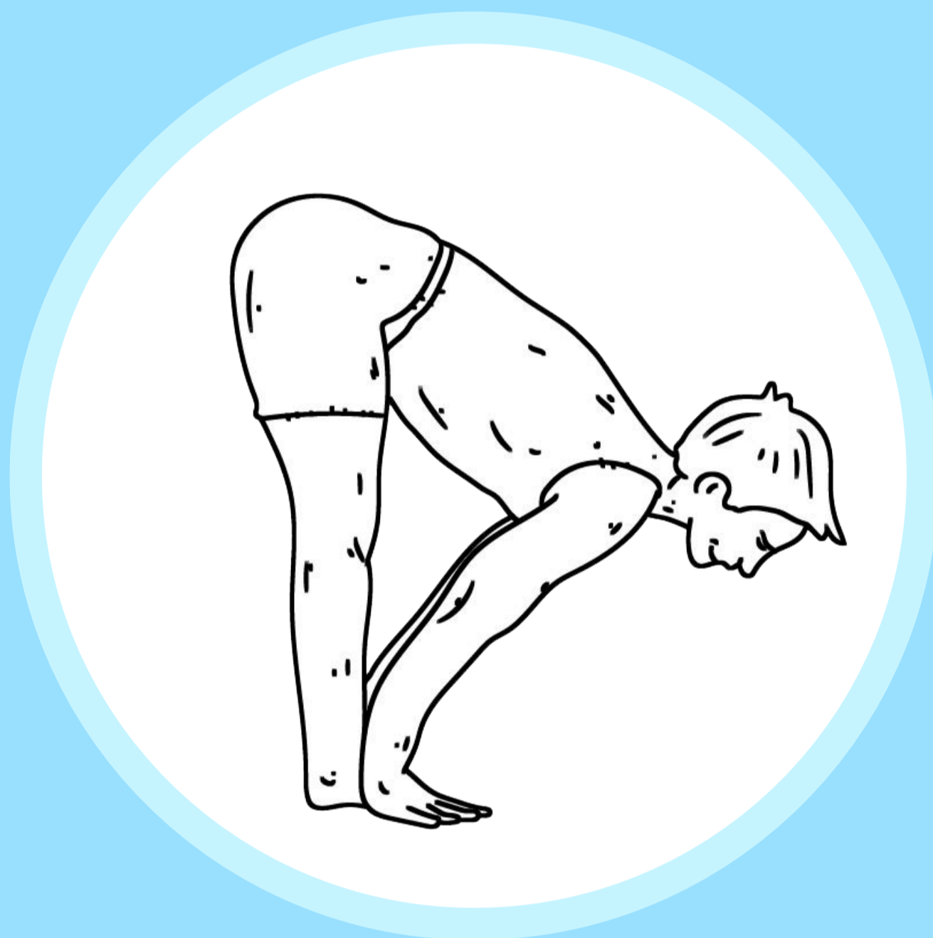
Uttānāsana (forward fold, halfway lift)