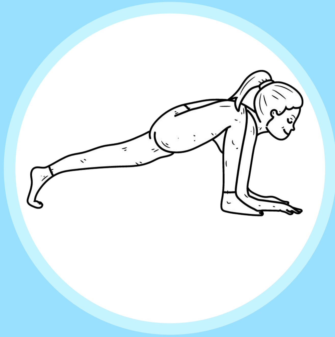
Utthan Pristhasana (lizard)