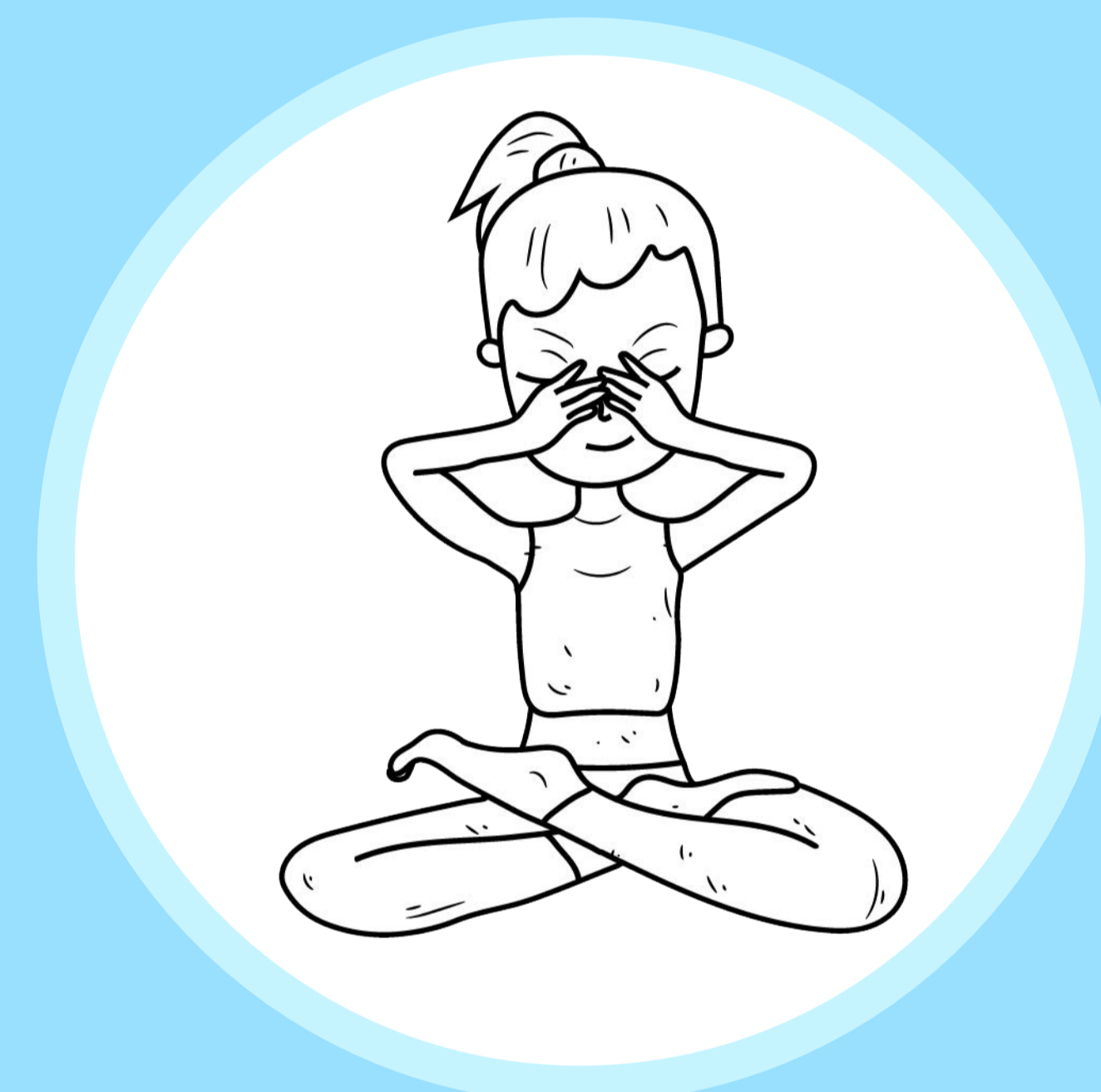
Śanmukhi Mudra (six mouths)