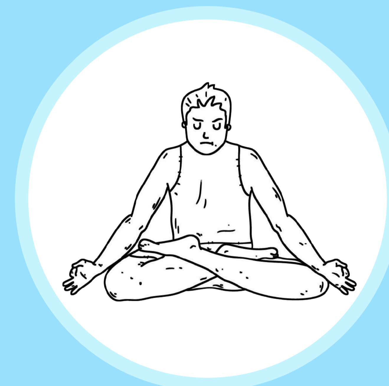
Ujjayi Pranayama Without Retention