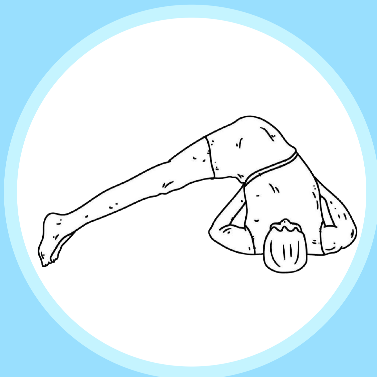
Pārśva Halāsana (side plow)