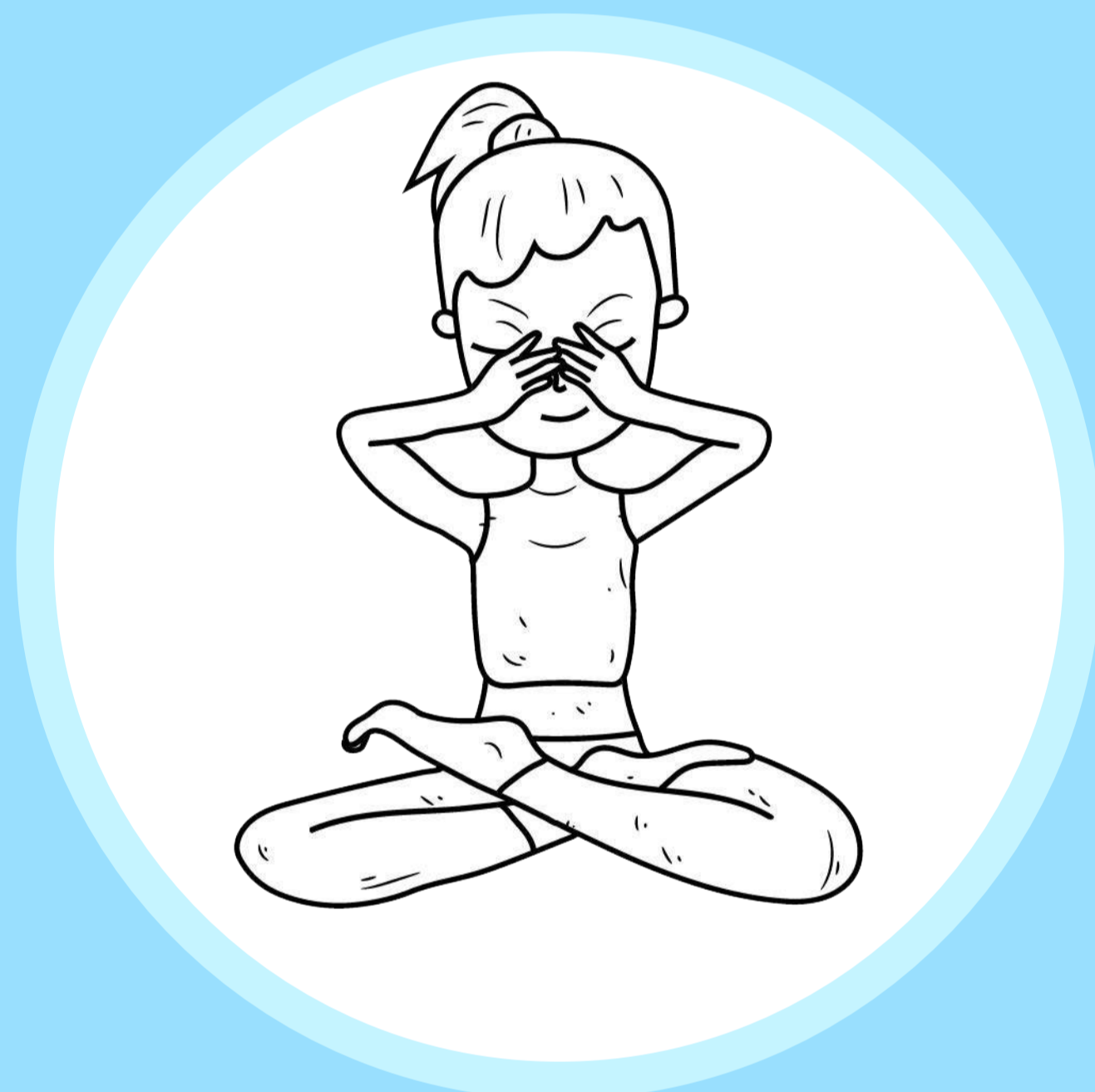
Śanmukhi Mudra (six mouths)