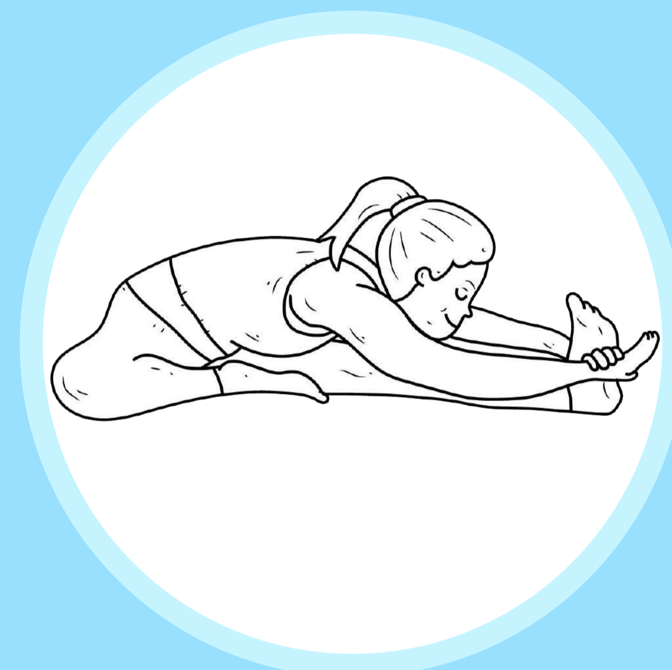
Jānu-Śīrṣāsana (head to knee)