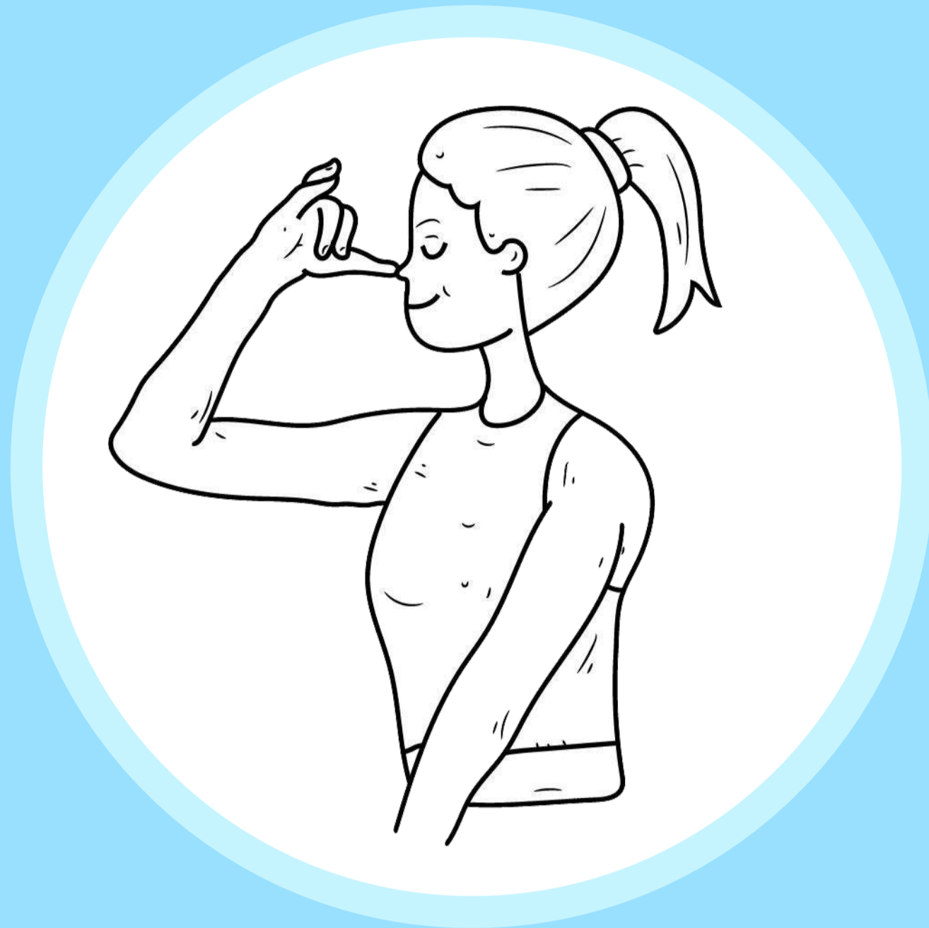
Nādi Śodhana (alternate nostril breathing)